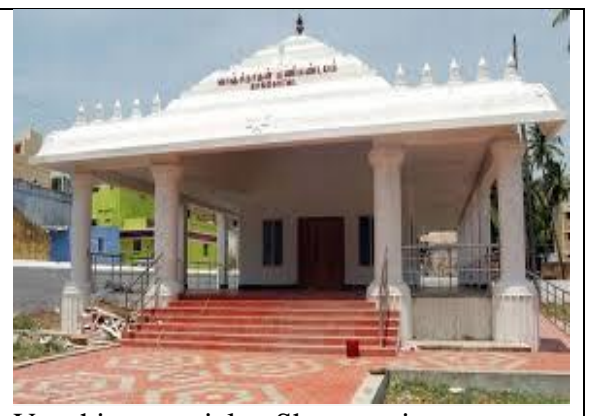
Vanchi memorial at Shencottai