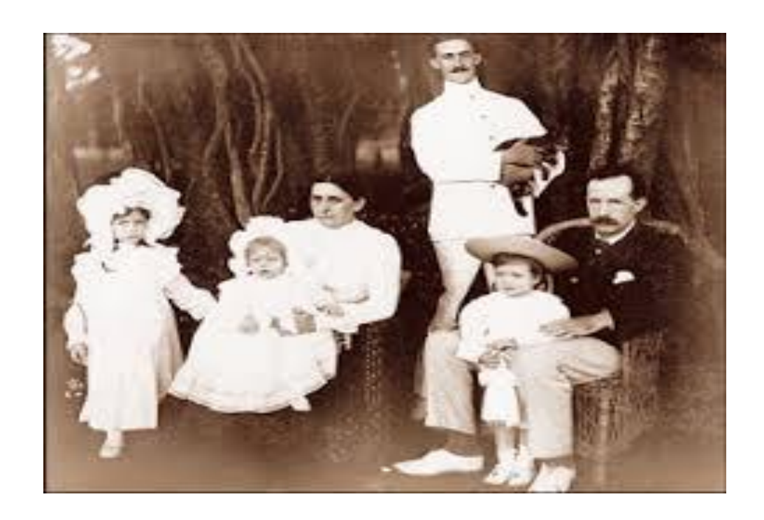
Family of Ashe

In that time people of North Indian revolted against the British involving themselves in the war of Independence. The steps taken by Lord Curzon to subdue the revolt created restlessness and enmity among the people. To protest that order, people rose in revolt under the leadership of Balagangadhara Tilak. The government suppressed this revolt; many were prison particularly Bibin Chandra Pal was torched inside the prison. In 1907 Bibin Chandra Pal who was released. His extremist principles awakened the Tamils and they began to campaign against the government. At the same time great martyrs like V.O.C, Subarmania Siva and like leaders were arrested and imprisoned. Hearing the atrocities suffered by the people in prison Vanchinathan wanted to eliminate Collector Ash who responsible for the prison sufferings.